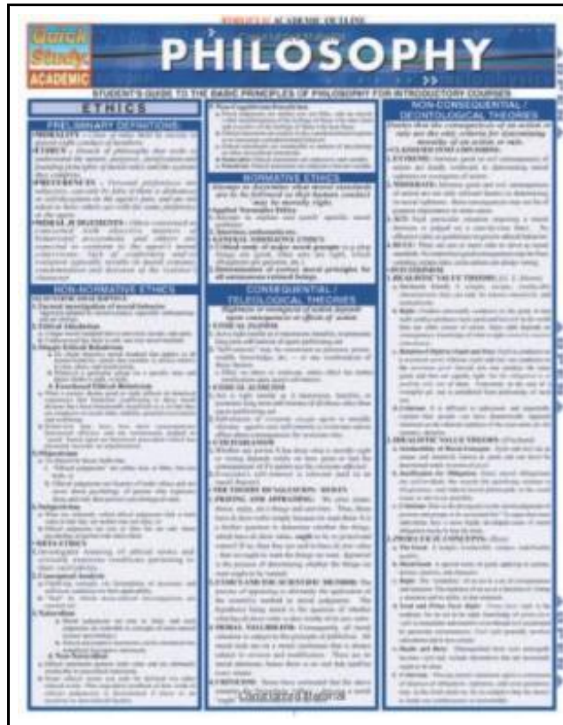
Filesize: 2.63 MB